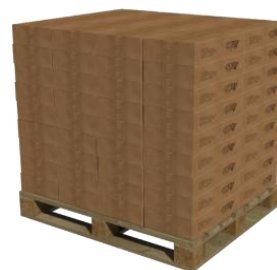
72 cartons per pallet