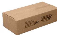
Cartons of 200